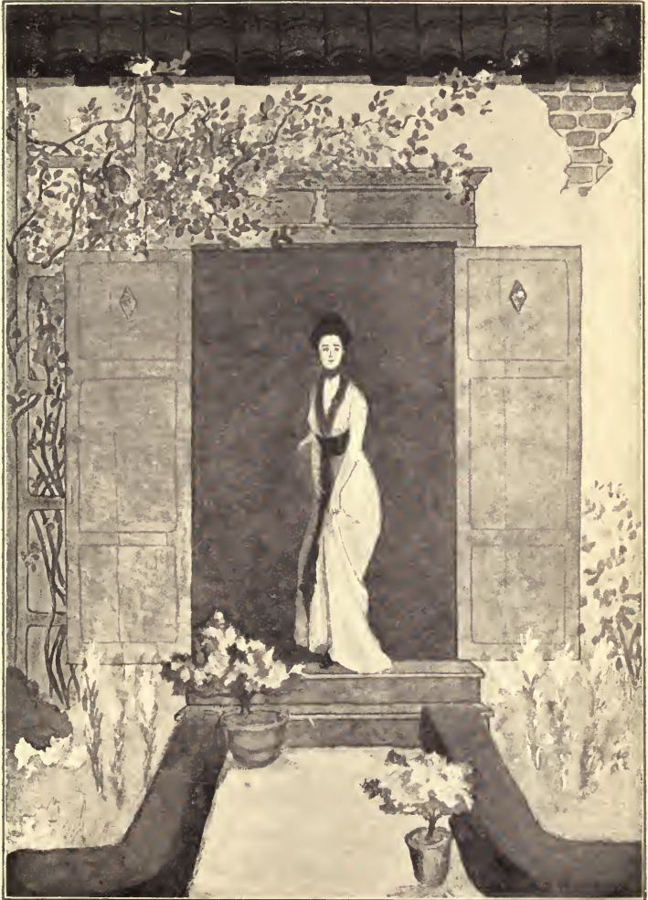
“ A LADY STOOD IN THE VINE-COVERED DOORWAY.”